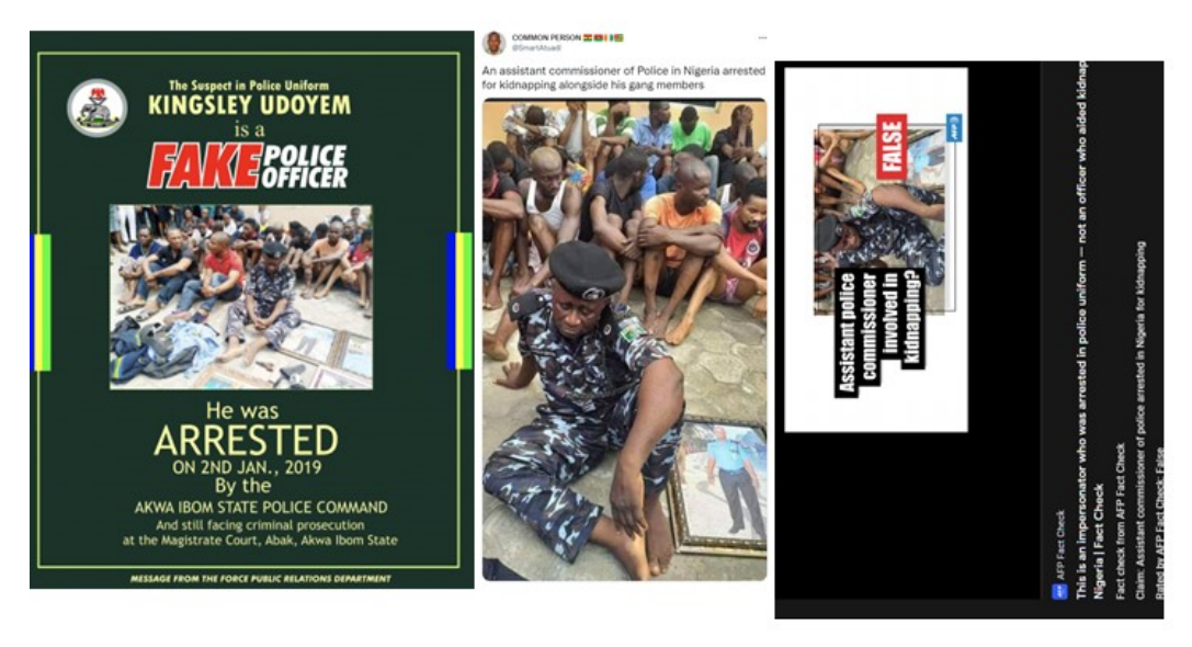
Figure 6. Fake news about a DCP in Nigeria

members of his kidnapping gang. The real story is that the said deputy commissioner was an impostor. He stole the uniform which he wears whenever he goes out on armed robbery or kidnapping activities. He was caught with his gang members, but mischief makers went online to say he was a bona fide police officer in Nigeria, intending to either probably smear the image of the Nigerian police or occasion some kind of socio-cultural commotion that will make Nigerians rise against dutiful policemen and women across the country.