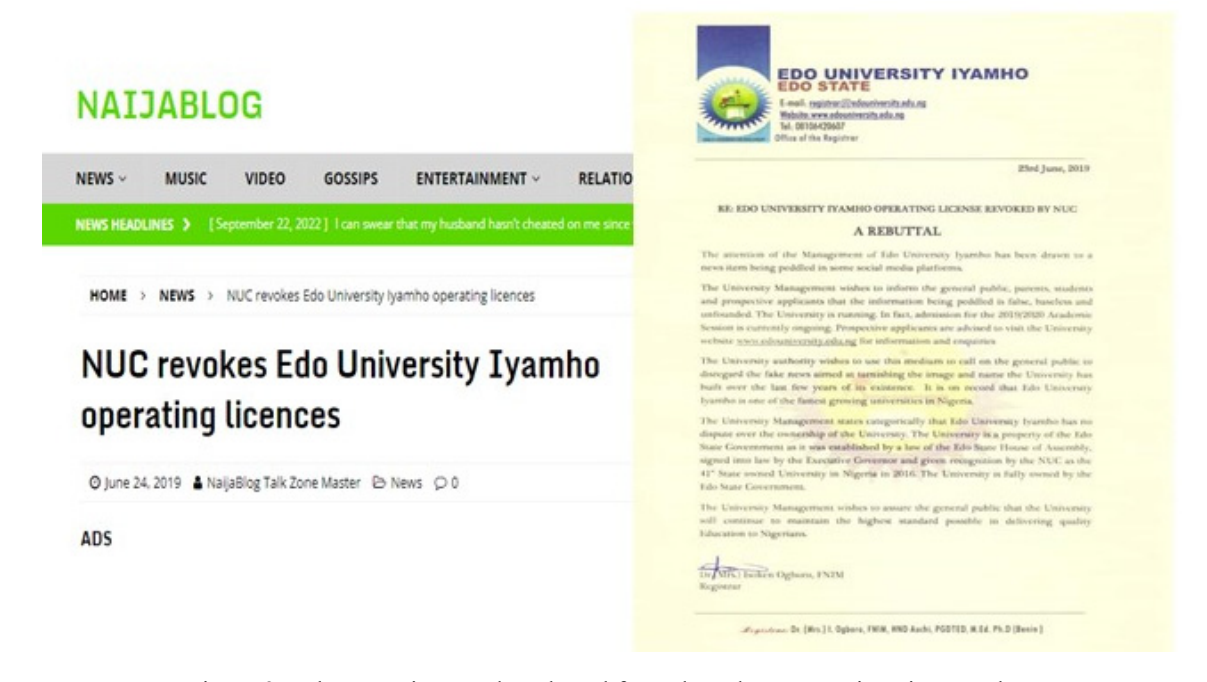
Figure 3. Fake news item and a rebuttal from the Edo State University Iyamho

Fake news is potentially disruptive in socio-political terms. It may have been generated by fake news peddlers because