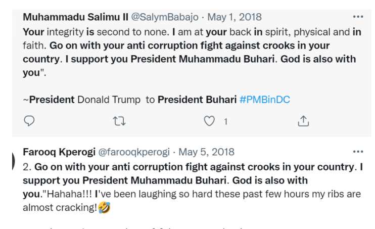
Figure 2. Samples of fake pro-Buhari Trump quotes