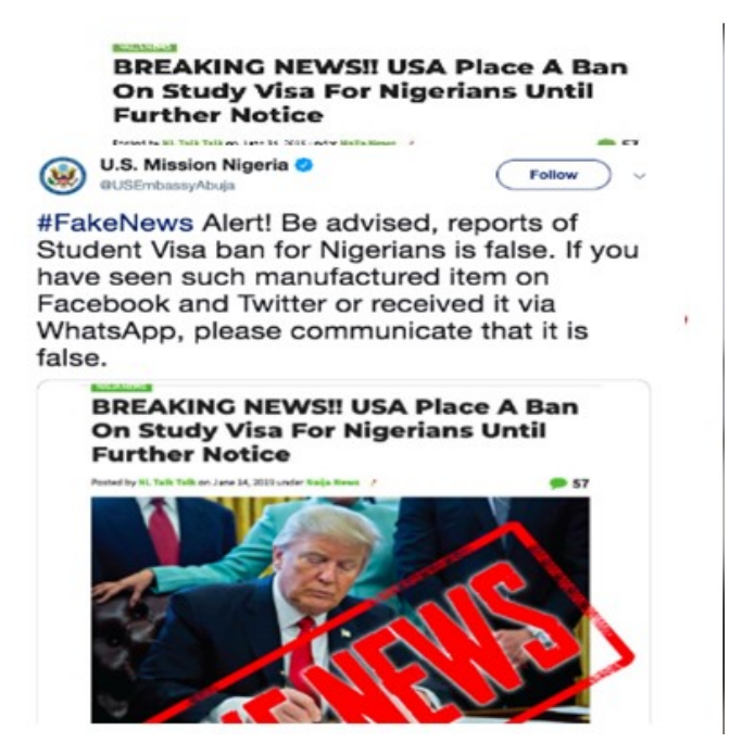
Figure 9. A screenshot of a fake news story about the US visa ban