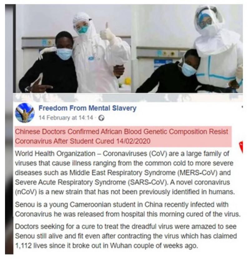
Figure 8. A screenshot of a fake news story about COVID-19

many in self-isolation or practising social distancing to avoid spreading the highly contagious disease. It is not a gimmick by those in government to siphon money as 'usual.' As of now, China has experienced a great number of deaths as a result of COVID-19. This is the same story in most parts of Europe, the Americas and Africa. So, regardless of the socio-cultural inadequacies of Nigerian leadership, the populace must heed the advisories such as personal hygiene, social distancing, social isolation and all other information purveyed via credible media such as the Nigerian Television Authority (NTA), Cable News Network (CNN), British Broadcasting Corporation (BBC), among others.