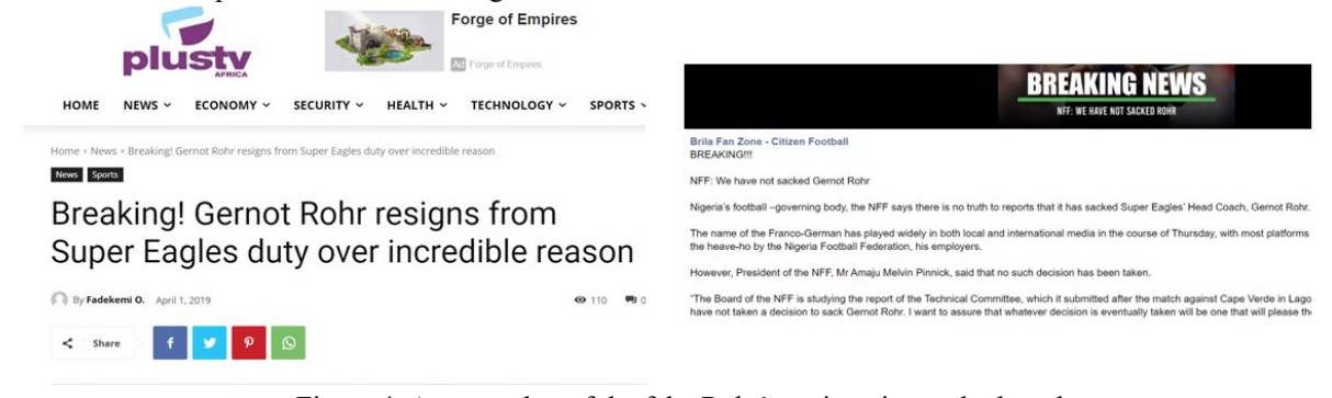
Figure 4. A screenshot of the fake Rohr's resignation and rebuttal