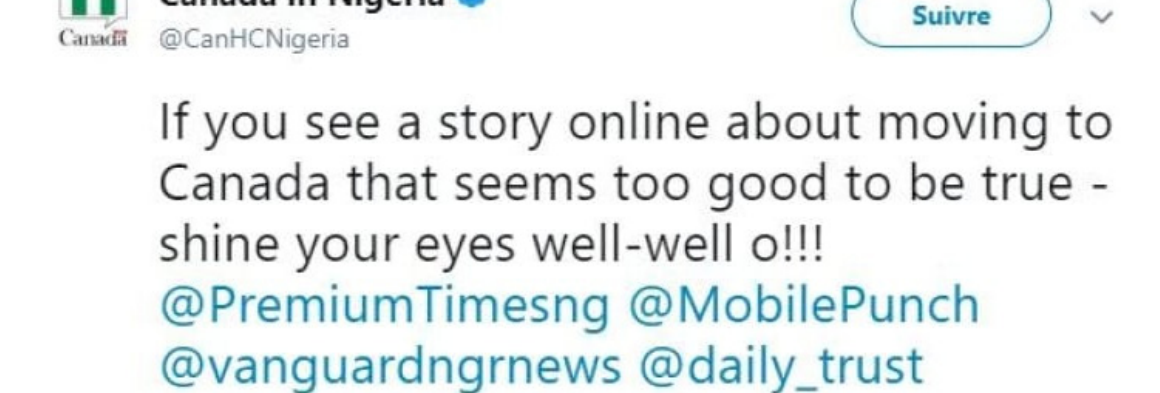
Figure 5. A screenshot of the fake Canadian visa program

Many Nigerians are involved in both regular and irregular migrations. It is possibly because of this that some internet scammers framed up a thematic message on migration to Canada. The online message was widely circulated in Nigeria to hoodwink the 'travel-hungry' Nigerians and frisk them of their money. However, the Canadian Embassy in Nigeria has issued a letter that Nigerians should disregard such information. But the point is that many such fake stories on immigration-related matters are spread daily on many social media platforms, especially encrypted WhatsApp groups in Nigeria. Many Nigerians have fallen victim to such shenanigans and are still counting their socio-economic losses.