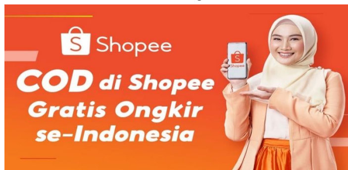
Image 1. Shopee

Here's an example of online advertisement that contain slang word.