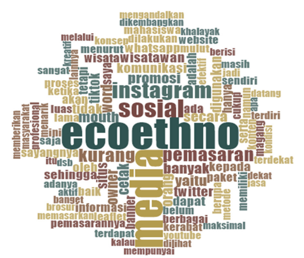
Figure 3. Word Cloud of Development Models

In the marketing communication media section, the researcher made a data visualization in the form of a Word Cloud, to see the words that often appear in the Ecoethno marketing communication media code in Figure 3. Based on the results of processing with NVivo, many words that often appear in marketing communication media codes mention Ecoethno as a unique jargon or brand, then social media is widely used as a source of information and as a strategy carried out by Ecoethno Leadcampsite, namely Instagram, Twitter and Tiktok Word. of Mouth. So internal marketing through small commercial advertisements is carried out by Ecoethno Leadcampsite.