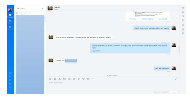
Figure 2. Clark (student) communicated with the lecturer about the Final Exam