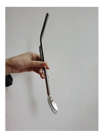
Figure 4. in mainland China

Tina expressed her ideas related to the course. She described the phenomenon of her product. She also said that;