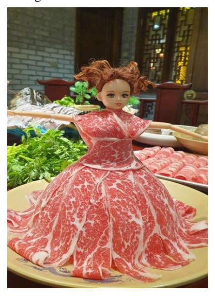
Figure 5. The photo was taken by Sy in Cambodia

We got the stunning picture from Tina in mainland China in the photovoice while Sy from Cambodia shared. She also expressed this during her learning to speak English in Cambodia.