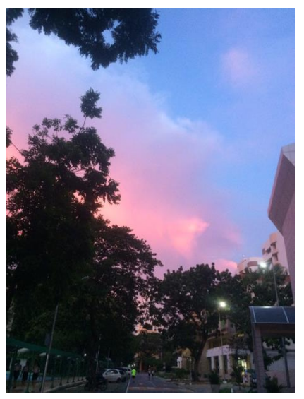
Figure 3. The photo was taken by Gift in Thailand

With photovoice reflection, the participants shared their thoughts on learning to converse across cultures. During the pandemic, they exchanged some images and offered their thoughts while learning from afar. Based on their common photo, they expressed their English voice as a voice reflection. While international students shared their thoughts, we received a positive impression. We only chose the best image of thoughts and comments from the many that were provided.