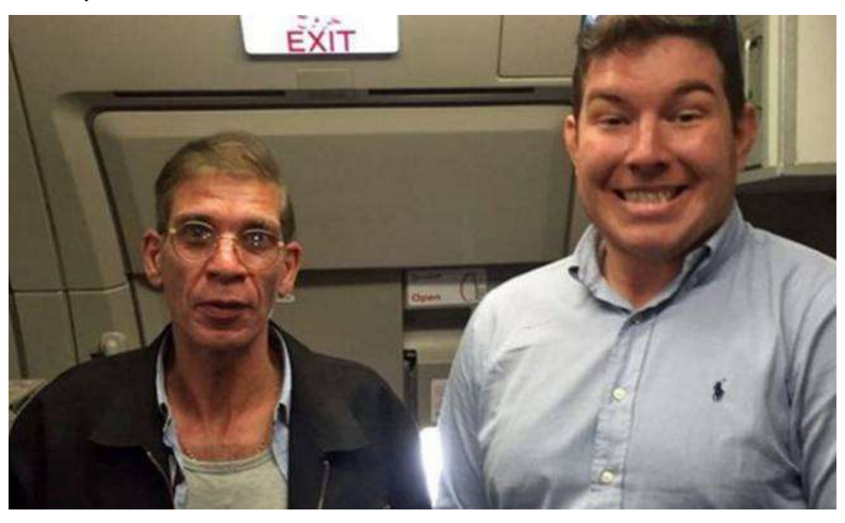
Picture 2. Selfie with the alleged terrorist in an airplane take over in Cyprus.

Additionally, journalists today instead of presenting the news seem to be the news, as they deploy tactics of self-representation while in the process of searching for news. Selfies depicting journalists with their interviewees, while reporting on site —even in war or terrorism situations — seem to be among the most shared content in the digital world, much more than the news content itself. In March 2016, in an alleged terrorist take over of an Egyptian airplane in the airport of Larnaca, Cyprus, one of the passengers publicized in his social media profile a selfie with the alleged terrorist<sup>2</sup>. The selfie was instantly shared and reproduced by the global media, bringing forward a notion of infotainment to the news story.