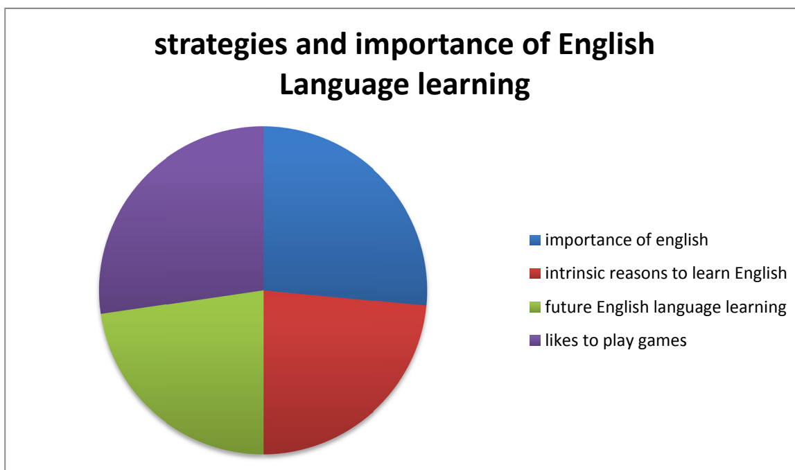
Figure 2. Questionnaire 2

This chart below shows the results of the percentage of the opinions of the students who enjoyed playing games, want to learn more English and have found intrinsic reasons to learn English in the future.