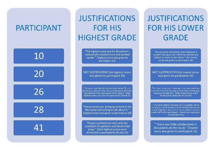
Table 2. Justifications for grades in Team 17

In the other two groups whose results were significant between the average of the PA grades and the MTBL, no data explicitly show the presence of "halo effect", when analyzing the grades and justifications from each member. The grades given by team members were similar.