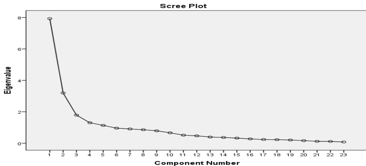
Figure 1. Line Graph for Eigenvalues

As the absolute value below was determined as 0.40, values less than .40 was suppressed in items sorted by descending. For this reason, factor loadings given in Table 5 refer to only those factor loadings more than 0.40 (Can, 2014). Factor loadings were determined as 0.40 to make scale items more qualified and distinctive.