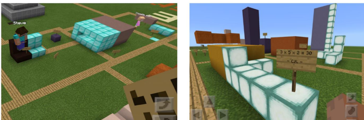
Figure 4. Samples of students' work for Mission 2–Volume

The visualization of area and volume in Minecraft provided preservice teachers with opportunities to develop their understanding of the concepts through not only focusing on the definitions of area and volume but also making connections between geometric concepts and algebraic concepts during the problem solving. These opportunities also allowed preservice teachers to develop their knowledge of how students would learn the mathematical concepts through problem solving, using and connecting multiple representations, and making connections among mathematical ideas that are emphasized as effective teaching practices (AMTE, 2017; NCTM, 2000, 2014). This knowledge development of student learning was further supported by preservice teachers' comments and reflections in the following sections.