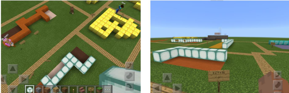
Figure 3. Samples of students' work for Mission 1–Area

Most preservice teachers first covered the 2D shapes on the floor, using blocks/stones that had outlines separating each unit square face. Then they counted out the unit squares to find the areas of the shapes (see Figure 3). In finding rectangle areas, several only covered the edges of the rectangles and multiplied the numbers of the unit blocks covering the edges (e.g., 3 \times 7 = 21 ). This strategy resulted in a connection between geometry and algebra leading to the common area formula (i.e., Base \times Height ). A couple of players counted out the unit blocks forming each shape based on the outlines of unit squares that appear when touching the shape.