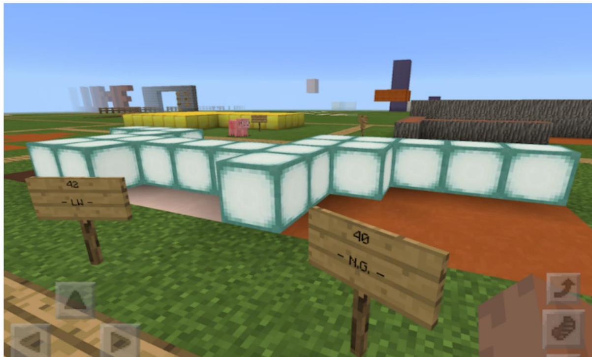
Figure 2. Samples of students' answers

Multiplayers go to each spot and compete to put up signs with their answers—the areas or volumes of the given shapes. The player who puts the highest number of signs up with correct answers is the winner. A player can put up a sign regardless of how many signs exist in a given location if she/he thinks they are incorrect (see Figure 2). Only the first correct answer will be counted.