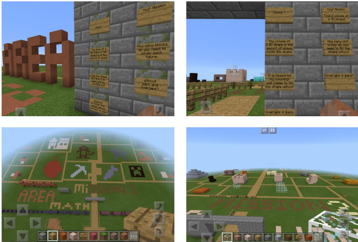
Figure 1. Mission 1–Area & Mission 2–Volume

Multiplayers go to each spot and compete to put up signs with their answers—the areas or volumes of the given shapes. The player who puts the highest number of signs up with correct answers is the winner. A player can put up a sign regardless of how many signs exist in a given location if she/he thinks they are incorrect (see Figure 2). Only the first correct answer will be counted.