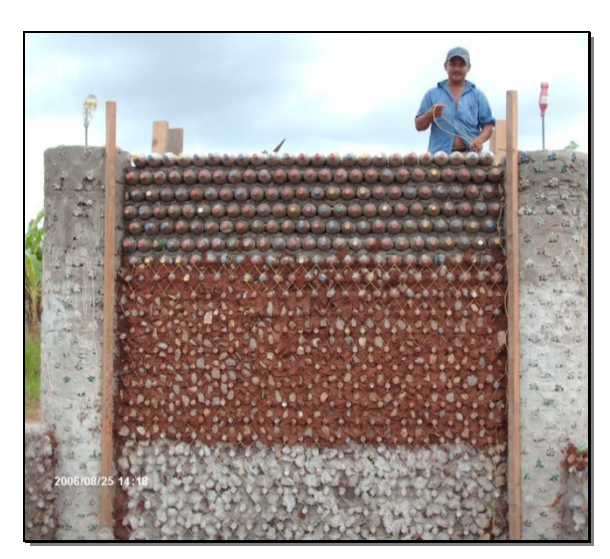
Figure 2 and 3. Building house out of plastic bottles in Honduras

In a mathematics lesson the teacher could first ask students to develop their own questions in relation to the situation in group work. Questions would then be collected on the blackboard and structured according to whether they can be answered with the help of mathematics or not. Afterwards students could decide for one question to answer, e.g. the question of how many plastic bottles are needed to build such a house. Students would then work in groups to investigate the problem and seek for solutions. Depending on how familiar the class is with IBL, assumptions could be first discussed in class or the students could continue directly in groups to estimate the number of bottles per row, the number of rows and so on. After calculating the number of bottles needed, they would communicate their solutions in class. Then, either in group or in class discussion students could reflect on the solution and validate it.