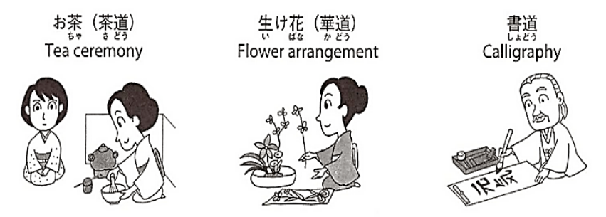
Image 4. The visuals used in the section of "Japanese Traditional" (Banno et al., p. 226).

As seen in the table 6, the devices used for the creation of cultural awareness in the customs element were detected as "Describing and explaining the culture" and "Picture". Here is a sample part where the "Picture" device was used: