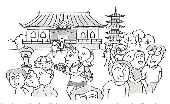
Image 1. The visual used in the dialogue text of "Mary's host family's house" (Banno et al., p. 102).

The devices used for the creation of cultural awareness in the architectural element were detected as "Picture" and "Describing and explaining the culture". Here is a sample visual: