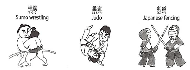
Image 3. The visuals used in the section of "Japanese Traditional" (Banno et al., p. 226).