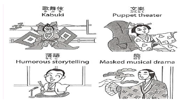
Image 2. The visuals used in the section of "Japanese Traditional" (Banno et al., p. 226).

The devices used for the creation of cultural awareness in the folklore element were detected as "Dialogue", "Picture", "Reading text" and "True/False". Here is a sample visual: