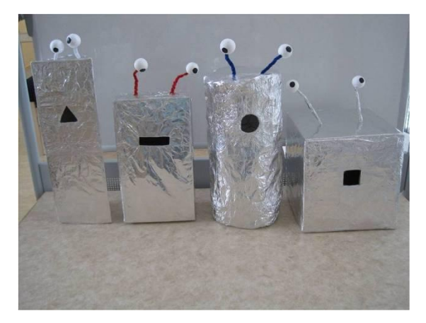
Figure 2. Robots used in study 1 (Landgren & Sv ärd, 2013)

more of a 'circle time' (normal duration about 20 minutes). They started by handing out four different geometrical forms to each child, naming them and allowing the children to touch and feel the blocks. Then, the children who had a cubicle were supposed to move around when the teacher held up a cubicle and played the drum. The teachers' intention was to let the children move about while discerning a form. However, the drum and movement became the centre or attention of this activity, not the object of learning. After this activity, the teachers showed the children a big suitcase full of cans, boxes, and packages of different forms, which the children were to sort into four different piles; however, as the teachers had not designated clear areas for the piles of each form, the activity became slightly chaotic. After the intervention, the teachers themselves found that they needed to structure the learning time better, so they introduced four robots of different forms in cycle B (see Figure 2). These robots were giant geometrical blocks, eating blocks the same forms as they were. A game in which children could move about was still conducted in cycle B. It was not until cycle C that the teachers dropped the extra games and concentrated on the forms. It then became possible for the children to discern the critical aspects of the geometrical forms during the intervention. Notably, the children did not miss the extra games: for them the blocks and robots seemed sufficient.