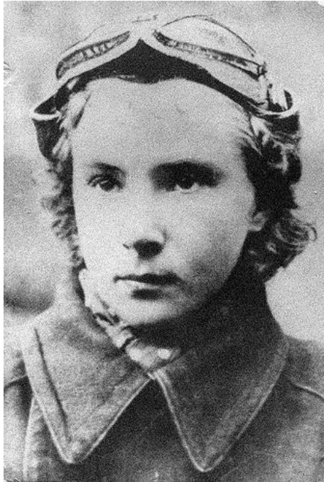
Figure 6. Lydia Vladimirovna Litvyak