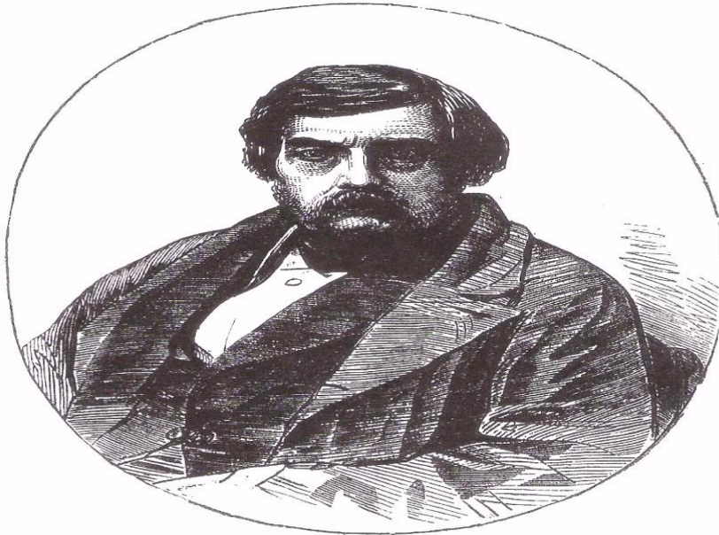
LIEUT.-COL. W. H. SYKES, F.R.S., M.P. FOR ABERDEEN.

Presidency. Further promotion followed to the rank of major in 1826, and although the office of Statistical Reporter was abolished in 1829 to secure financial savings Sykes continued to work gratuitously in that role until June 1833. It was during this period that he completed a census of the Deccan, two statistical reports and a catalogue of birds and mammals of the area (Smith Elder and Co, 1885). He subsequently published his natural history that included 56 birds new to science, in the Proceedings of the Zoological Society in 1832, as well as writing other natural history papers.