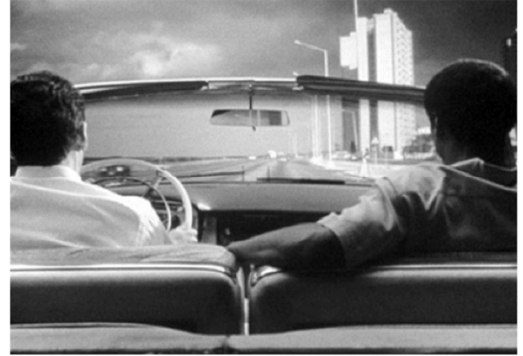
Figure 1. Stan Douglas, Inconsolable Memories, 2005.

Douglas manipulates the original film of Gutiérrez Alea changing the characters and introducing them to a divergent historical context in order to approach the problem of memory, history and identity. This approach is made by a combination of fact and fiction narratives. The recombination (the scenes are recombined each time the film is repeated) produces a spatialization of the temporal structure of the film. Douglas absorbs the viewer into twists and memory displacements recovered from the original film. He somehow confronts a combination of documentary reality and film portrait in which develops a poignant analysis of these elements.