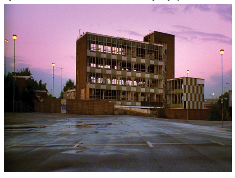
Figure 3. Mark Lewis, North Circular , 2000.

The localization process is inherent to the medium of film and Mark Lewis dialectic and analytically reconfigures this process placing a modern architecture building in ruins as the main actor of the movie. Lewis uses locations indicating some idea about the spatial and temporal architectural utopia of modernity of the late 60s and he uses it anachronistically. The criticism of architectural utopia of modernity as contextual space is a characteristic of Lewis' work. Modernity trying to embody social structures and ideals in a body of material designed to live and to be experienced. Lewis incorporates the failure and obsolescence of the utopian project in his work.