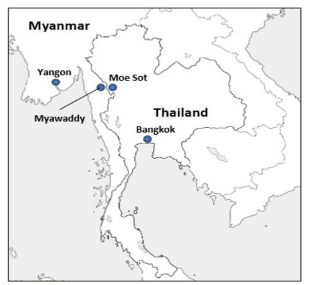
Figure 1. The location of Myawaddy and Mae Sot

As shown in Figure 1, the Myawaddy district of Kayin in Myanmar is the key point of land transport in South East Asia, as it is located near the border to Thailand and along Asian Highway Route 1 (AH1), also known as the 'East-West Economic Corridor', which connects Myanmar (west) to Vietnam (east). Its area is approximately 3,000 km<sup>2</sup> and has a population of approximately 68,000, not including about 20,000 migrant workers who have crossed the border and live in the Mae Sot district of Thailand (Limskul and Taguchi, 2012). The government in Kayin, which was devolved by the central government of Myanmar, plans to develop the industrial area named 'MIA', and has already completed the phase 1 plot for DDI (Domestic Direct Investment).