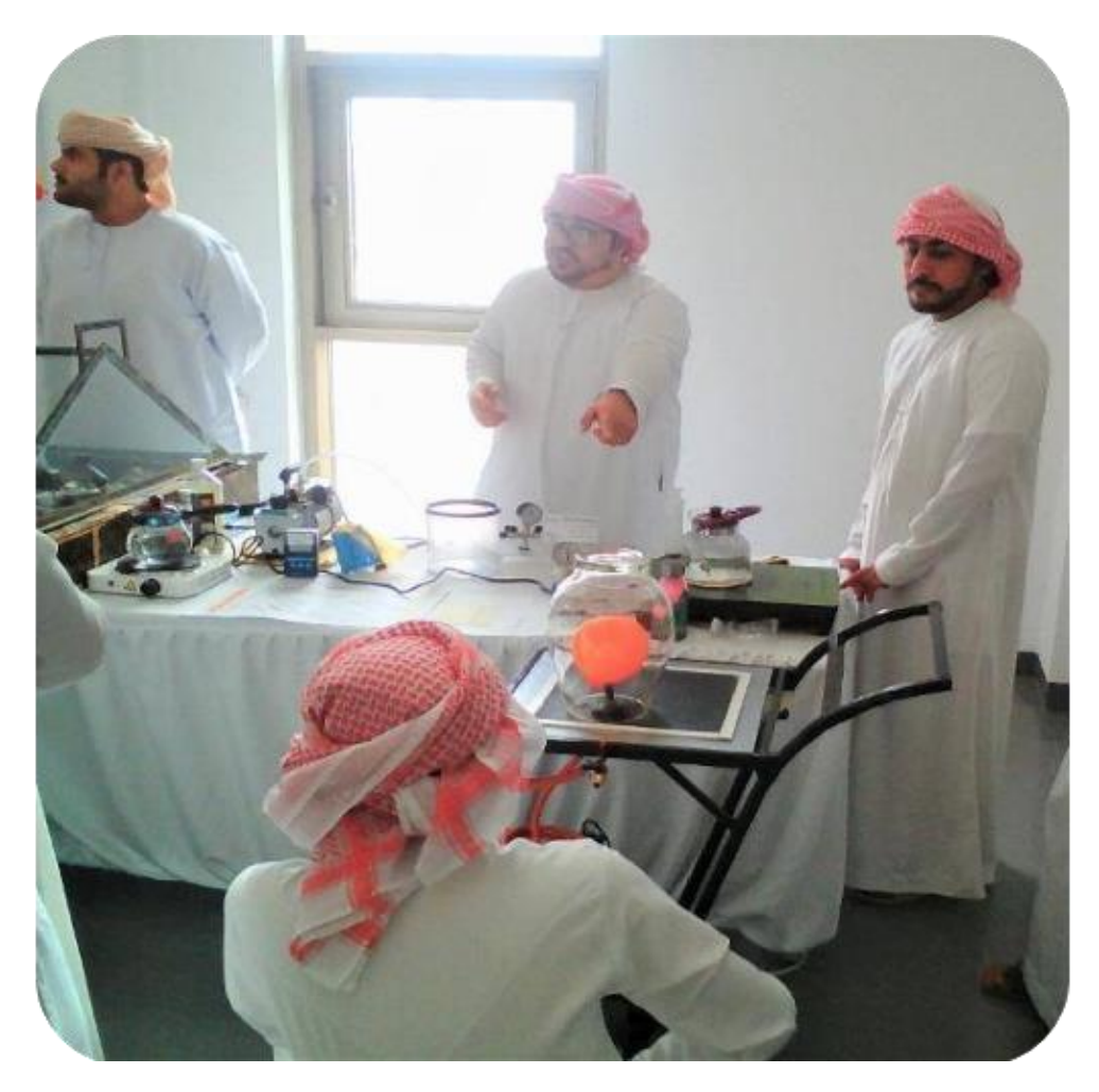
Figure 7. The balloon expansion experiment