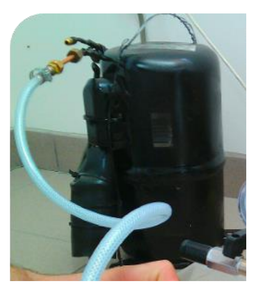
Figure 2. The compressor used in our work, before assembling it within the vacuum generator