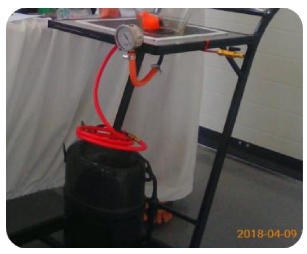
Figure 3. The compressor used in our work, after assembling it within the vacuum generator

For the vacuum chamber, we decided to use ready glass containers (large vases) in the market. To use the chamber, it should be flipped upside down such that its rim rests on a horizontal gasket. The rim surrounds a suction port connected to the inverted compressor. This achieves sealing that increases as evacuation progresses. It also allows flexibility with installing chambers since any gas-tight container with an opening that can rest on the gasket can be used as a chamber without any customization. The gasket has a square shape with a side length of 26 cm. It was made from the tube of a car tire.