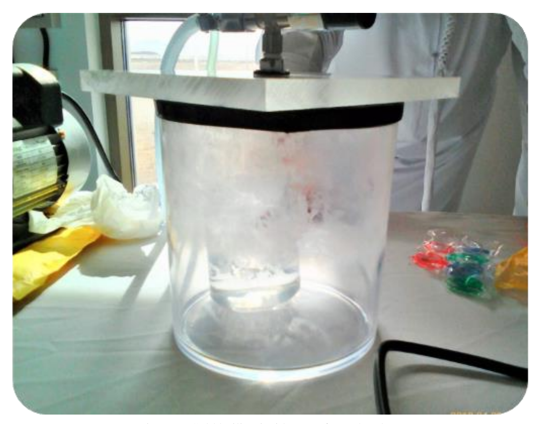
Figure 6. Cold boiling inside one of our chambers