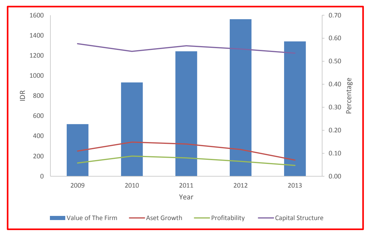
Figure 2. Descriptions Trend Profitability, Asset Growth, Capital Structure & Value of the Firm Year 2009–2013

From Figure 2 above it can be seen the variable value of the company proxied by stock market prices from 2010 to 2012 grew at a fairly high growth rate on average by 48.25% and in 2013 this relatively large value of listed companies fell by -14% from the previous year. The variables company' growth and profitability in the same period of 2010 to 2012 haves decreased and in 2013 this decline continued and it was relatively larger. The variable capital structure was decreas in after 2009 by 5.8% until the year 2013, when it has increased with a relatively small rate of 3.43%. The improved capital structure is relatively small from 2010 to 2013 allegedly due to the increase in current liabilities for working capital purposes. The conditions from the perspectives of signaling theory are considered to be anomalies, especially in the variables company growth and profitability for the period 2010 to 2012, where the two variables have decreased but the variable company value have increased. The same thing happened to the variable capital structure where in the same period it increased relatively small, but the variable company value, has showed relatively large increase.