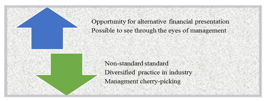
Figure 2. Benefits and Shortcomings of the Management Approach